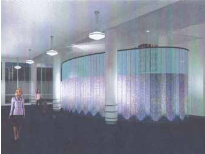
Exterior View from Concourse